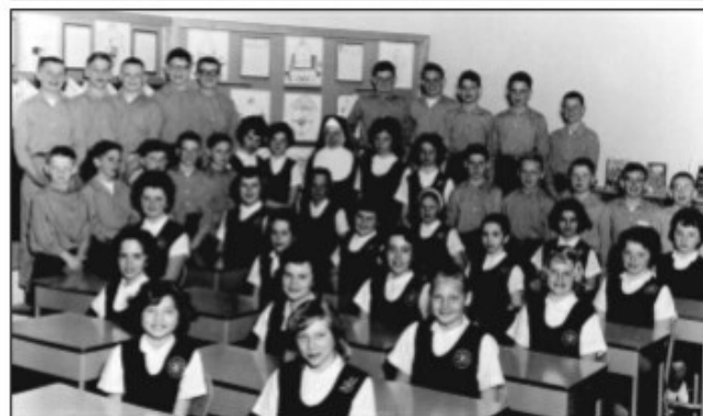
About one half of the class of 1964 in the 6th grade.