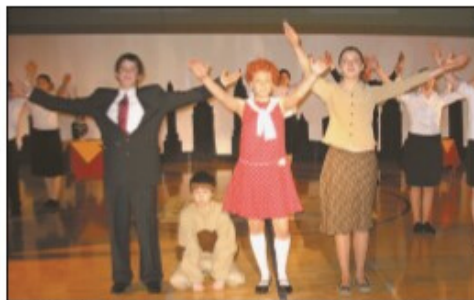
The final scene from Annie Jr. is captured by a parent's lens. Annie Jr. is the 3rd consecutive production hit presented by the students of our restored middle school.