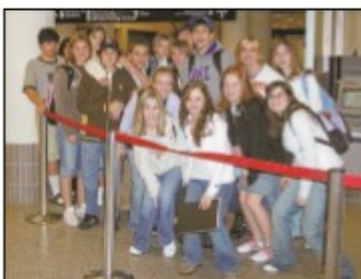
The Class of 2006 start on their "great adventure" to Washington, D.C.