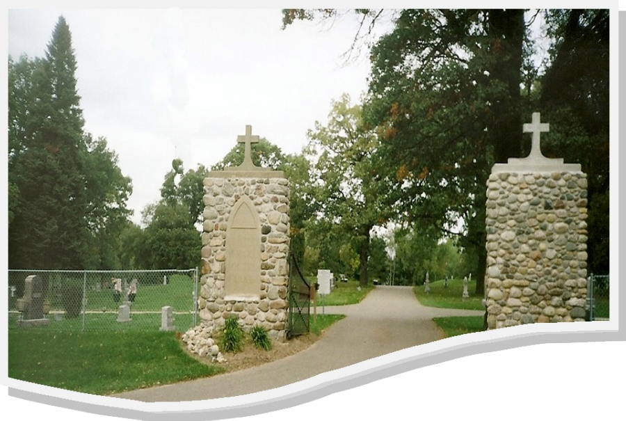
Stillwater Street (One block east of Otter Lake Road) White Bear Lake, Minnesota